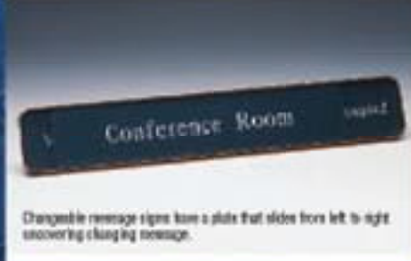
Changeable message signs have a plate that slides from left to right uncovering changing message.