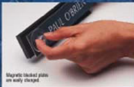
Magnetic blocked plates are easily changed.